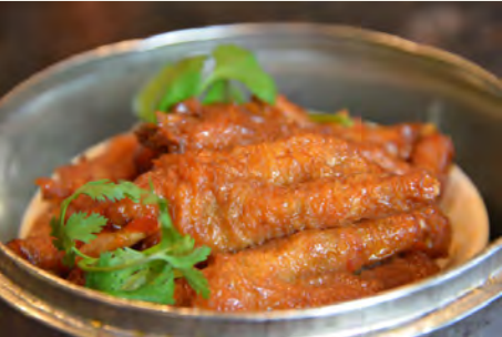
醬皇蒸鳳爪 Steamed Chicken Paws with Black Bean Sauce $4.98