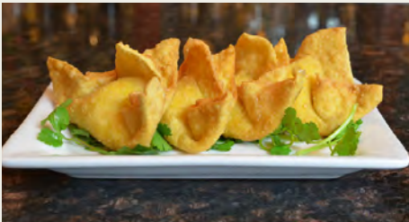
蟹角 Fried Crab Rangoon (6) $6.28