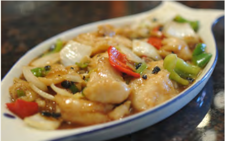
豆鼓魚片 Sole Fish Filet with Vegetable in Black Bean Sauce $14.98