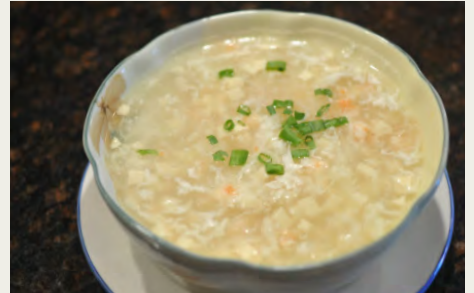
海鮮豆腐羹 $13.98 Seafood with Tofu Soup