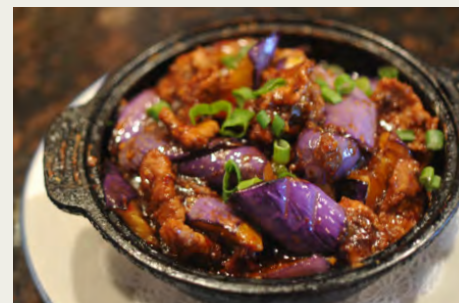
魚香茄子牛肉煲 🌶️ $13.98 Garlic Beef & Eggplant in Hot Pot