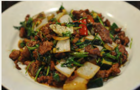
小炒牛肉 House Stir Fry Beef (Spicy/not) $12.98 小炒羊肉 House Stir Fry Lamb (Spicy/not) $15.98