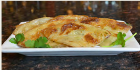
蔥油餅 Scallion Pancake $5.98