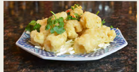
椒鹽魷魚 Salt and Pepper Calamari $9.98