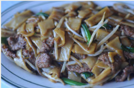
干炒素河 Chow Fun with Vegetable $9.98