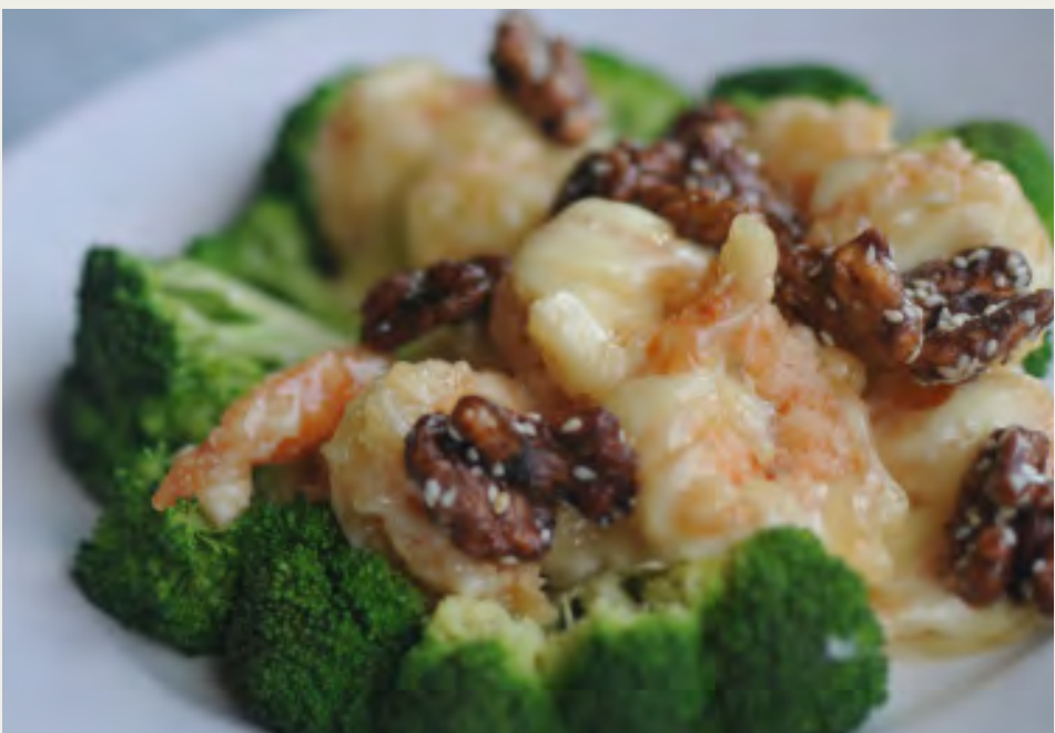
沙律核桃蝦球 Jumbo Shrimp with House Special Walnuts 芝麻大蝦 Jumbo Shrimp with Sesame Sauce 甜酸大蝦 Sweet & Sour Jumbo Shrimp