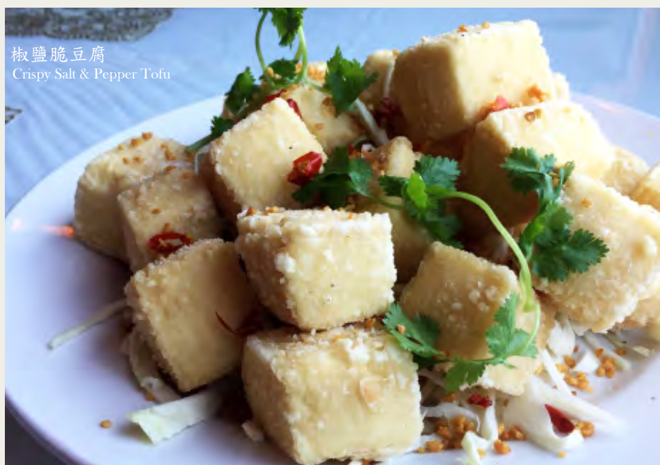
椒鹽脆豆腐 Crispy Salt & Pepper Tofu