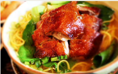
火鴨湯麵(粉) Roasted Duck Noodle Soup $10.98