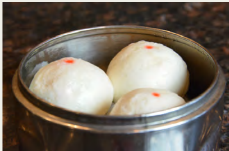
奶皇包 Steamed Egg Custard Bun (3) $4.58

BANQUET, MEETING ROOM, CARRY OUT, CATERING