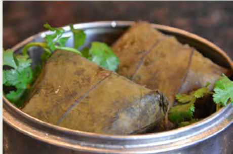
荷香糯米雞 Sticky Rice in Lotus Leaf (2) $6.28