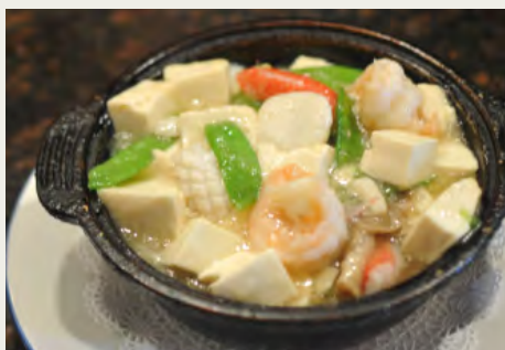
海鮮豆腐煲 $14.98 Seafood & Tofu in Hot Pot