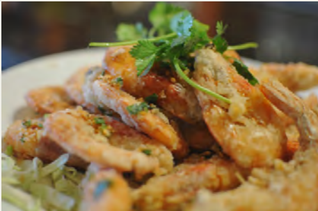
椒鹽有頭蝦 Salt & Pepper Shrimp with Heads