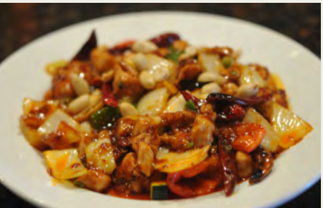
宮保雞 / 牛 Kuang Pao Chicken/Beef $11.98/ $12.98 腰果雞 / 牛 Cashew Chicken/Beef $11.98/ $12.98