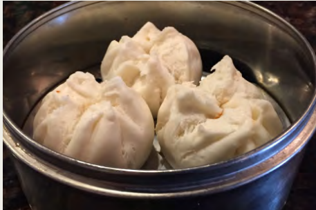
叉燒包 Steamed BBQ Pork Buns (3) $4.58