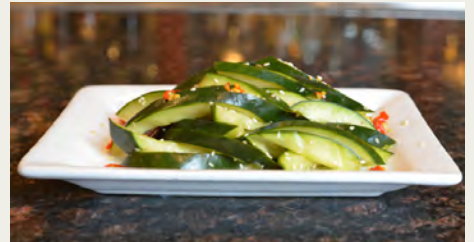
香脆黃瓜 House Cucumber $5.98