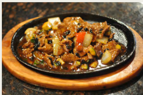
鐵板豆豉牛肉 $13.98 Beef with Black Bean Sauce on Hot Plate