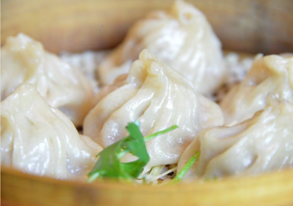
小籠包 Shanghai Juicy Soup Dumplings (6) $6.28