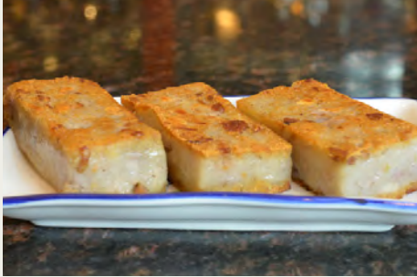
蘿蔔糕 Pan Fried Turimp Cake $5.98