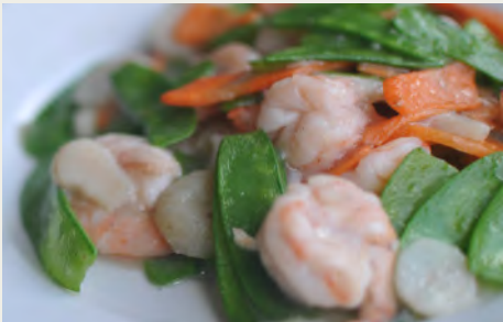
雪豆蝦球 Jumbo Shrimp with Snow Peas 蔬菜蝦球 Jumbo Shrimp with Vegetable