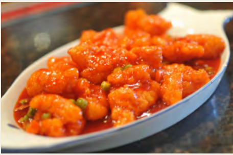
糖醋魚片 $14.98 Sweet & Sour Sole Fish Filet