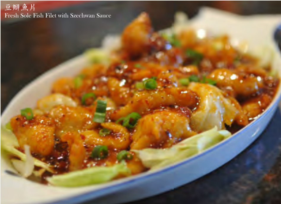
豆瓣魚片 Fresh Sole Fish Filet with Szechwan Sauce