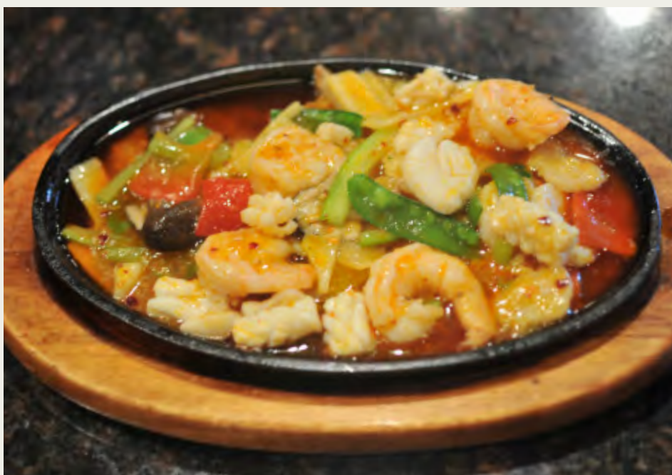
鐵板辣三鮮 🌶️ $16.98 Jumbo Shrimp, Scallop, Calamari on Hot Plate

BANQUET, MEETING ROOM, CARRY OUT, CATERING