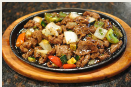
鐵板黑椒牛肉 $13.98 Black Pepper Beef on Hot Plate