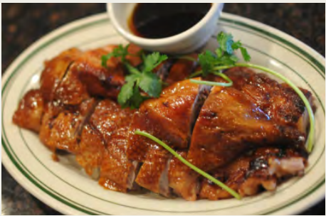
明爐火鴨(全) Roasted Duck (Whole) $21.98 明爐火鴨(半) Roasted Duck (Half) $13.98