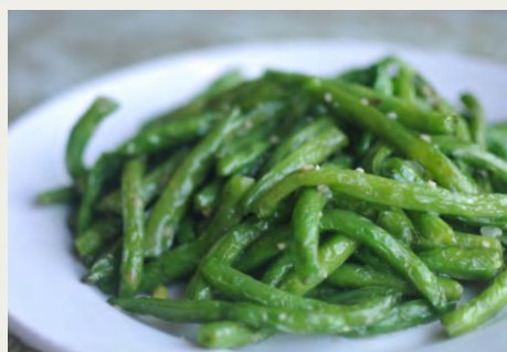
蒜蓉四季豆 Green Bean with Garlic $9.98