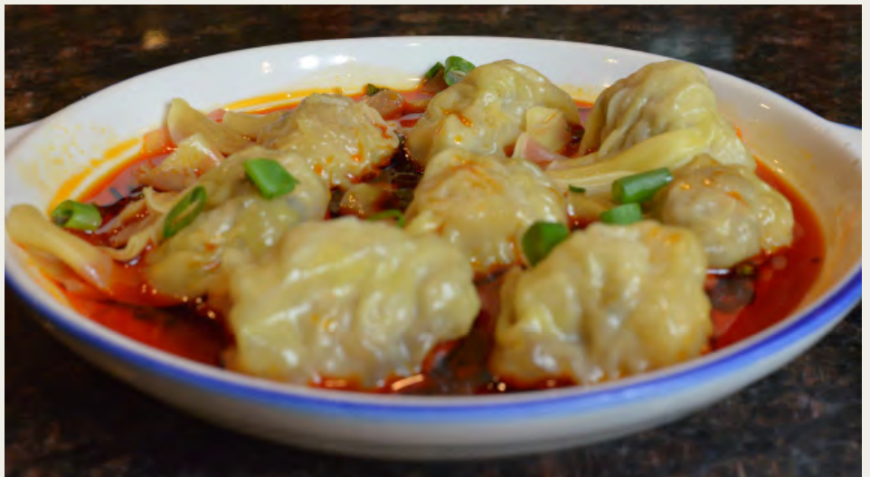
紅油抄手 Steamed Shrimp & Pork Wonton with Red Chili Sauce (8) $6.28

BANQUET, MEETING ROOM, CARRY OUT, CATERING