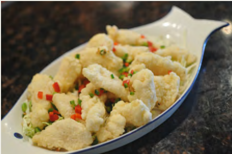
椒鹽魚片 $14.98 Salt & Pepper Sole Fish Filet