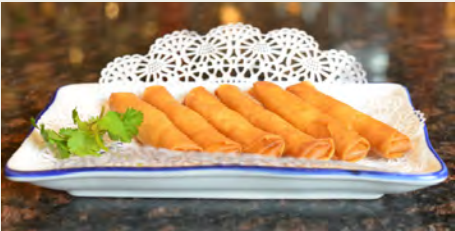
鮮蝦脆春捲 Shrimp Egg Roll $6.28