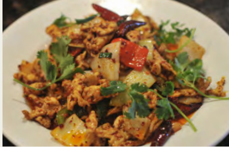
川香烤雞 Szechwan BBQ Chicken $11.98 川香烤牛 Szechwan BBQ Beef $12.98 川香烤羊 Szechwan BBQ Lamb $15.98