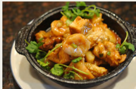
八珍豆腐煲 $14.98 Eight Treasures Tofu in Hot Pot