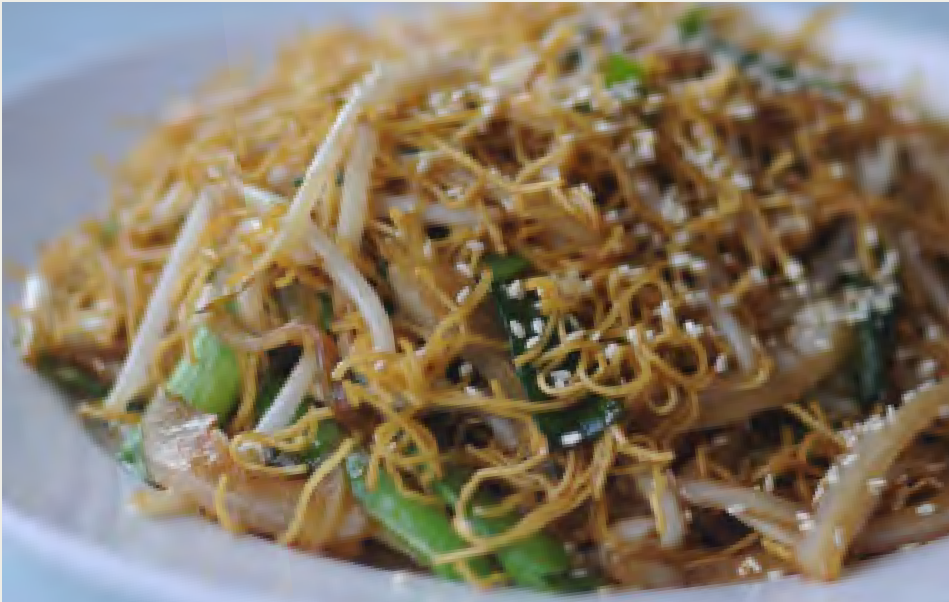
鼓油皇炒麵 Hong Kong Noodle $10.98