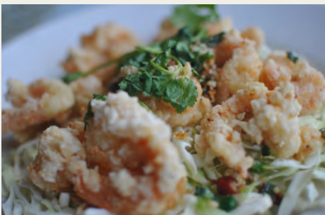
椒鹽蝦球 Salt & Pepper Shrimp