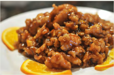
橙皮雞 Orange Chicken $11.98 橙皮牛 Orange Beef $12.98