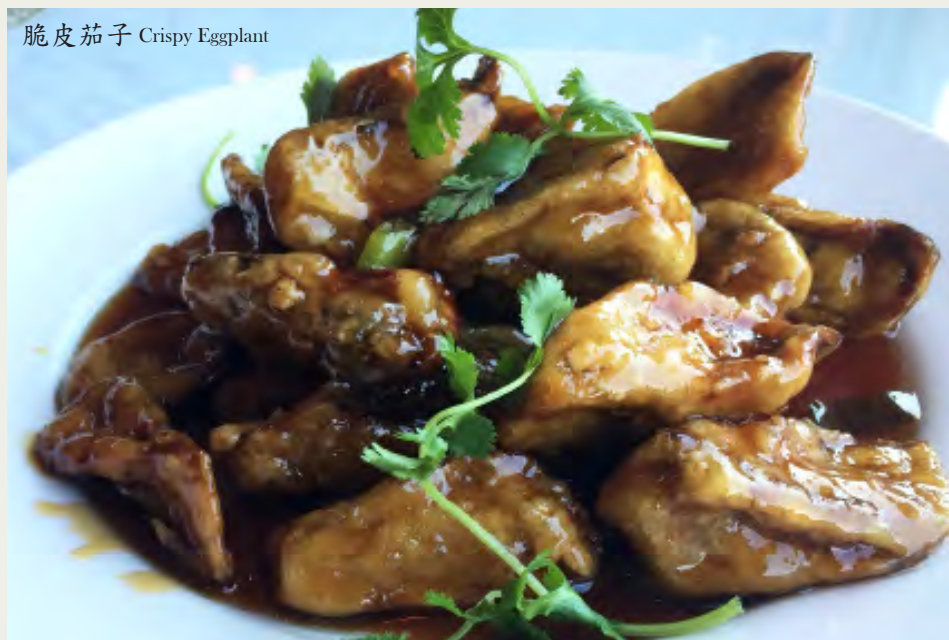
脆皮茄子 Crispy Eggplant