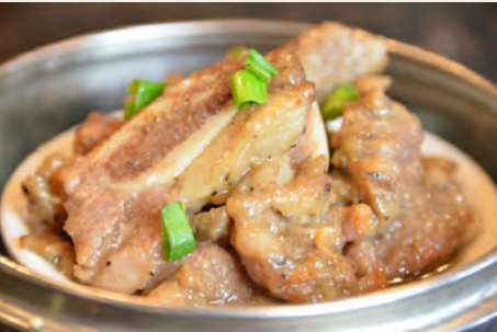
黑椒牛仔骨 Black Pepper Beef Chop $5.98