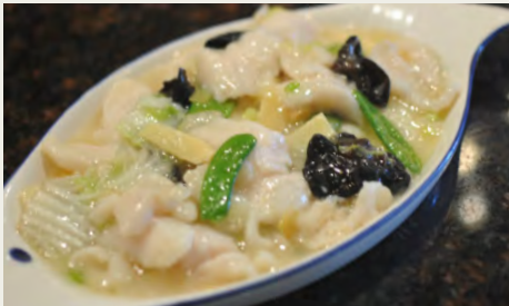
鮮溜魚片 Sole Fish Filet with Vegetable $14.98