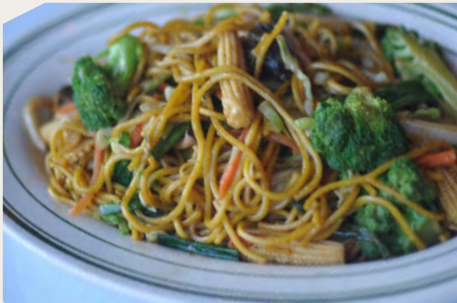
素菜粗炒麵 Vegetable Lo Mein $8.98