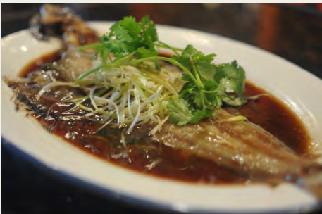
清蒸龍俐魚 $22.98 Steamed Whole Sole Fish with Ginger & Scallion