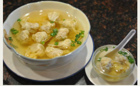
鮮蝦餛飩湯 3-4 People L $10.98 Pork & Shrimp Won Ton Soup 1 Person S $3.28