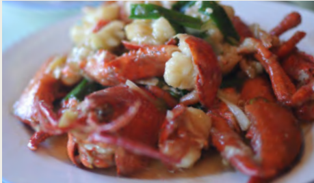
龍蝦(薑蔥/豆鼓/椒鹽/香辣) MP Lobster Tail (Ginger and Scallion/S&P/Black Bean Sauce)