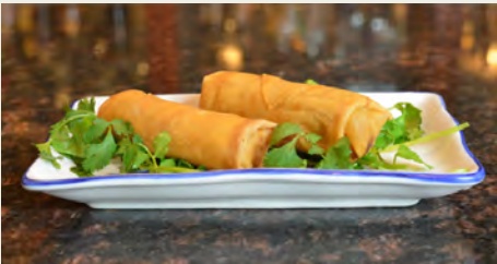
春捲 Vegetable or Pork Egg Roll (2) $3.98