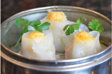
三星海鮮餃 Steamed Seafood Dumplings (3) $4.98