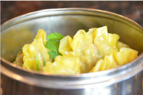
魚翅餃 Imitation Shark Fin Dumplings (4) $4.98