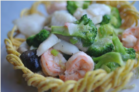
雀巢三鮮 Shrimp, Calamari & Scallop in Bird Nest