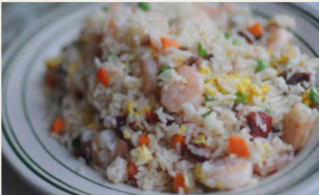
揚州炒飯 Yangzhou Fried Rice $11.98