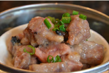
鼓汁蒸排骨 Spared Ribs with Black Bean Sauce $4.98