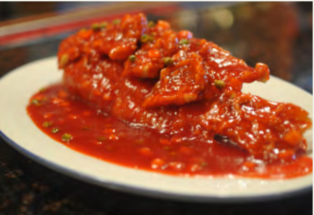
脆皮全立魚 $23.98 Crispy Whole Tilapia Fish with Chef Sauce