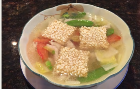
雞片鍋巴湯 Chicken Sizzling Rice Soup $12.98 海鮮鍋巴湯 Seafood Sizzling Rice Soup $13.98