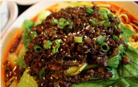
紅油擔擔麵 🌶️ Szechwan Dan Dan Noodle $10.98