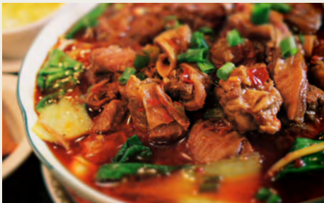
牛腩麵 Beef Stew Noodle Soup $10.98