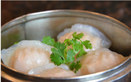
水晶蝦餃 Steamed Shrimp Dumplings (4) $ 4.98