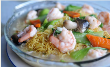
牛肉兩麵黃 Pan-Fry Noodle with Beef $13.98