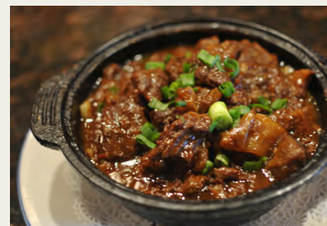
時菜牛腩煲 $13.98 Beef Stew in Hot Pot