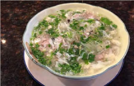
西湖牛肉羹 $12.98 Shredded Beef Porridge