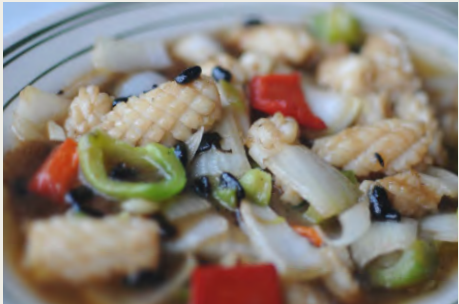
鼓汁鮮魷 Calamari with Black Bean Sauce