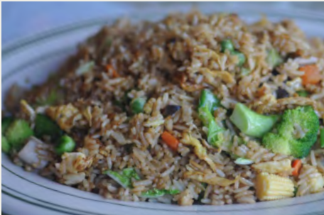
蔬菜炒飯 Vegetable Fried Rice $8.98