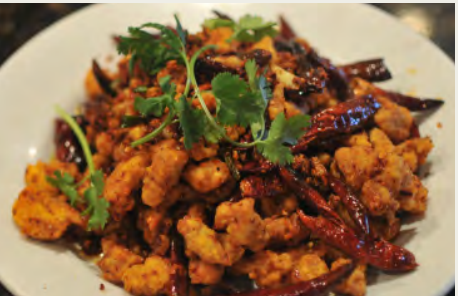
香辣雞丁 Hot Pepper Chicken $11.98 水煮牛肉 Szechuan Style Boiling Beef $13.98