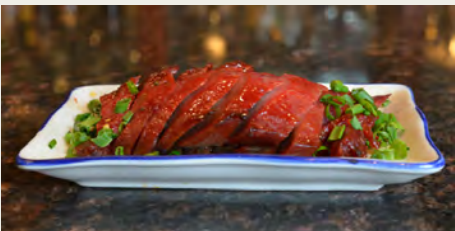
蜜汁叉燒 Honey Grilled BBQ Pork $6.98