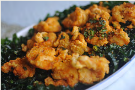
泰式咖哩蝦球 Thai Curry Shrimp 泰式咖哩魷魚 Thai Curry Calamari