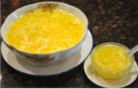
清爽蛋花湯 3-4 People L $8.98 Egg Drop Soup 1 Person S $3.28