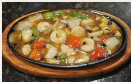
鐵板豆豉帶子 $18.98 Fresh Scallop with Black Bean Sauce on Hot Plate