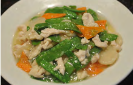
雪豆雞 / 牛 Chicken/Beef with Snow Peas $11.98/ $12.98 蔬菜雞 / 牛 Chicken/Beef with Vegetable $11.98/ $12.98