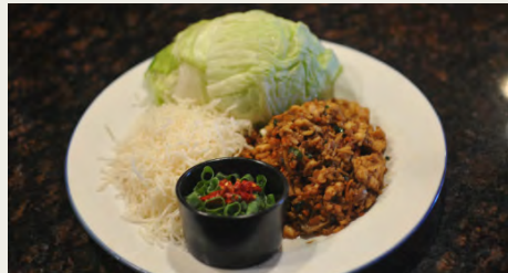
雞粒生菜包 Lettuce Wraps with Chicken $12.98