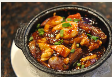
魚香海鮮茄子煲 🌶️ $14.98 Garlic Seafood & Eggplant in Hot Pot