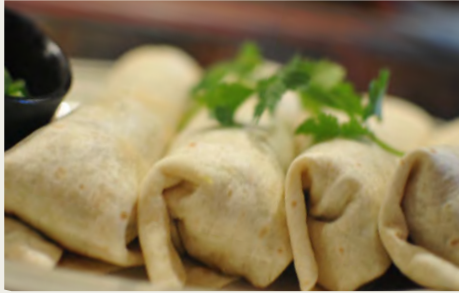
木須雞 / 肉 / 牛 / 蝦 $12.98 Moo Shu Chicken/Pork/Beef/Shrimp 木須菜 Moo Shu Vegetable $11.98