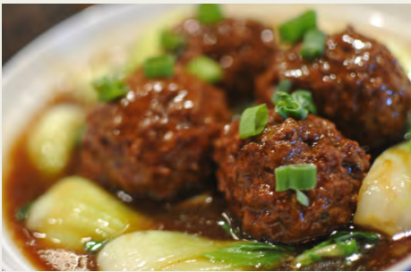
紅燒獅子頭 Shanghai Meat Ball $12.98