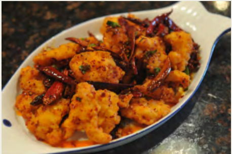
香辣魚片 🌶️ $14.98 Hot Pepper Sole Fish Filet