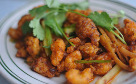
海鮮小炒皇 Jumbo Shrimp, Calamari & Scallop Chef Style