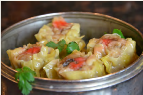
北菇蒸燒賣 Steamed Pork Shu Mai (4) $4.98