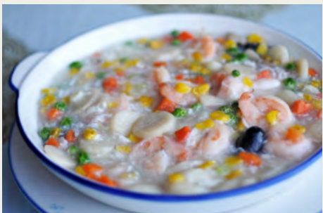
蝦龍糊 Jumbo Shrimp with Lobster Sauce