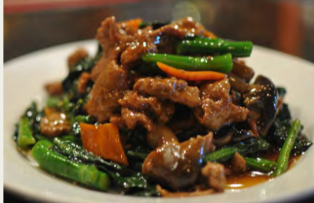
中國芥蘭牛肉 Beef with Chinese Broccoli $12.98 西蘭花炒牛肉 Beef with Broccoli $12.98