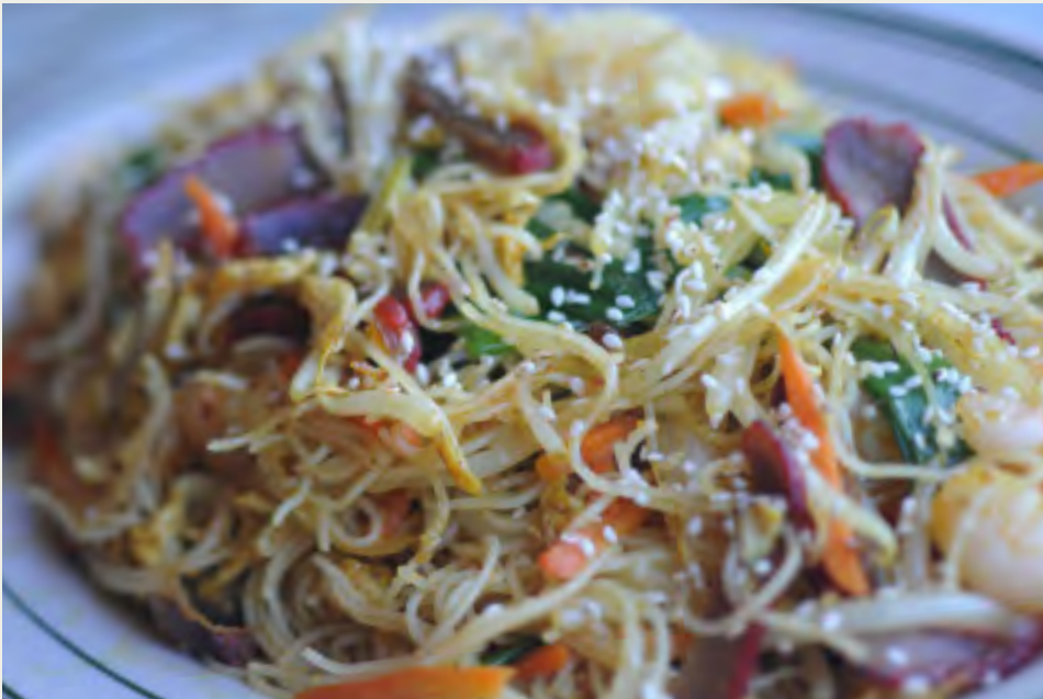
星洲炒米粉 Singapore Rice Noodle $11.98