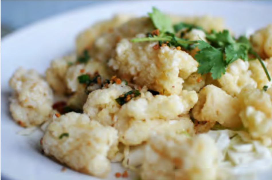
椒鹽魷魚 Salt & Pepper Calamari