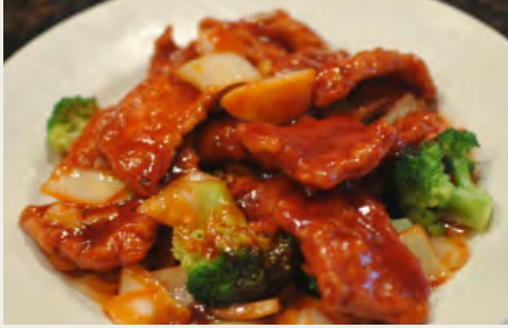
京都肉排 Stripe Pork Beijing Style $11.98 椒鹽肉排 Salt & Pepper Stripe Pork $11.98

BANQUET, MEETING ROOM, CARRY OUT, CATERING