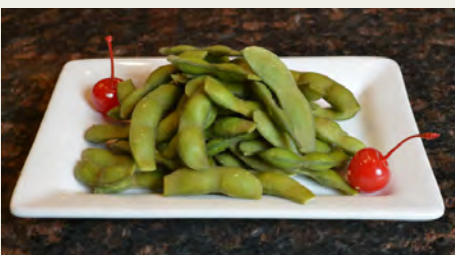
毛豆 Edemame $5.98