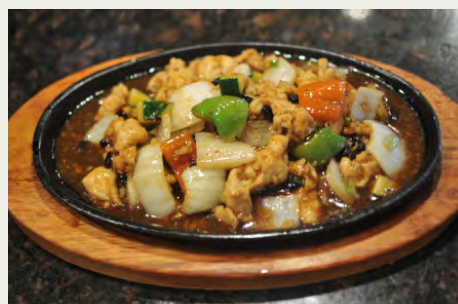
鐵板豆豉雞 $12.98 Chicken with Black Bean Sauce on Hot Plate