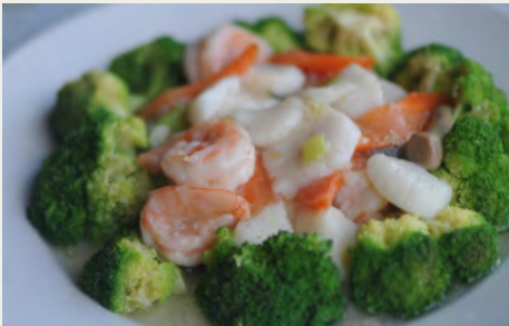
碧綠帶子蝦 Scallops and Shrimp with Vegetables