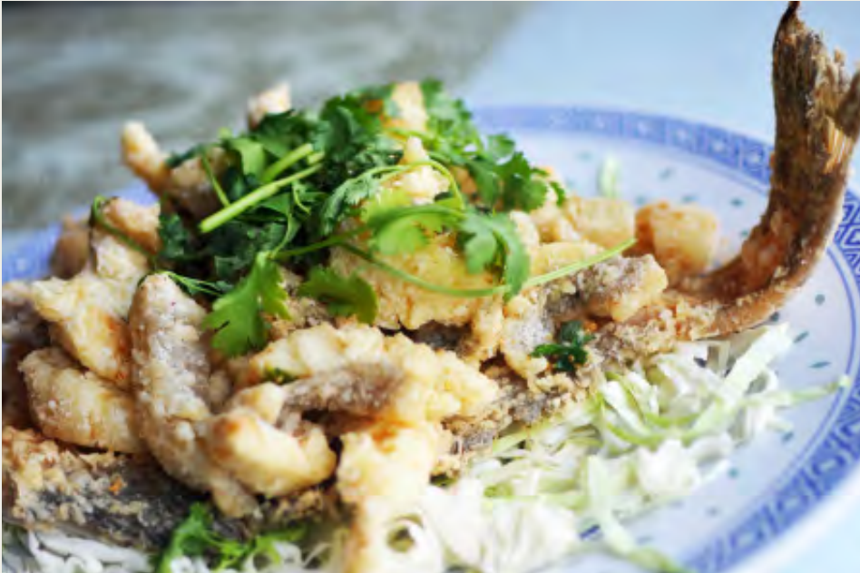
椒鹽龍俐球 Salt & Pepper Whole Sole Fish (Flounder) $23.98