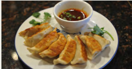
鍋貼 Pork and Vegetable Potstickers (8) $6.28