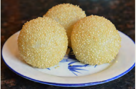
豆沙煎推子 Fried Sesame Ball with Red Bean Paste (3) $4.98