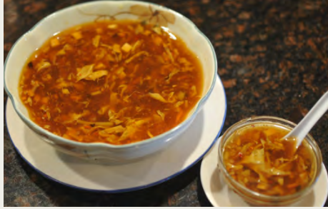
川味酸辣湯 3-4 People L $8.98 Hot & Sour Soup 1 Person S $3.28