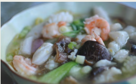
冬菇海鮮湯米(麵) $11.98 Seafood Noodle Soup