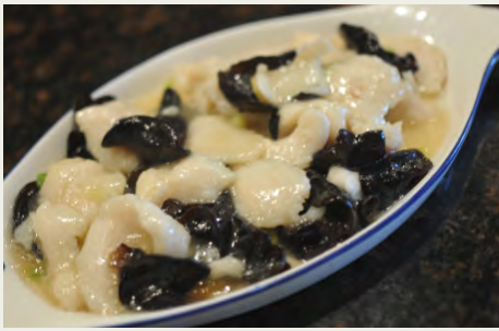
糟溜魚片 $14.98 Sole Fish Filet with Mushrooms in White Wine Sauce