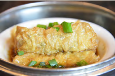
蠔油鮮竹卷 Deep Fried Beancurd Skin Roll with Oyster Sauce $4.98