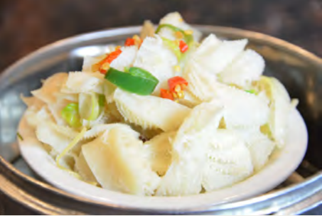
薑蔥牛百葉 Ginger Steamed Beef Tripe $4.98