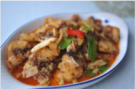
XO醬魚片 🌶️ $15.98 Sole Fish Filet with XO Sauce