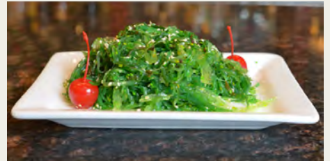
蒜香海帶絲 Seaweed with garlic $6.98