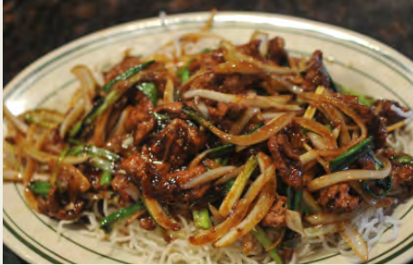
蔥爆牛肉 Mongolian Beef with Scallies $12.98 蔥爆羊肉 Mongolian Lamb with Scallies $15.98