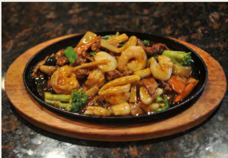
鐵板帶子牛蝦 Jumbo Shrimp, Scallop, Beef & Vegetable on Hot Plate $16.98